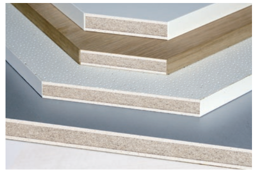
Individual design options

The RiBoard® surface panel is un-treated and can be custom designed to your needs: Specific custom decors (i.e. wood) can be perfectly re-produced in a variety of designs. In addition, the RiBoard® surface has a high colour consistency and stability for years to come. Panels for project additions down the road will have the same identical appearance. The RiBoard® panels can be easily processed and installed at the interior work site. The exposed edges can be banded without any pre-treatment.