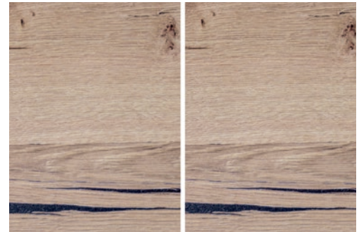
Wood sample (left) and identical reproduction